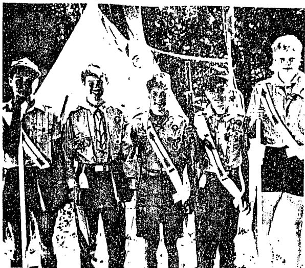
Don't miss out on a great time COUP TRAIL '92