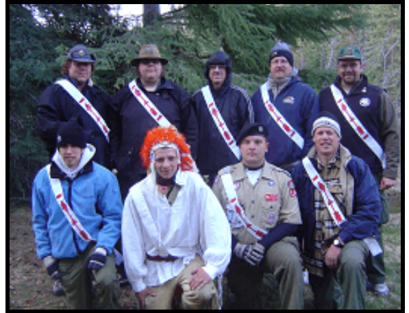
Vigil Class - May 2009