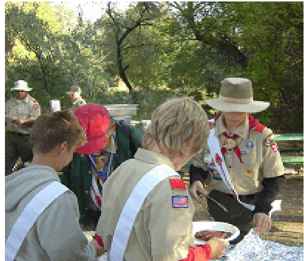
Food! - the best part of any event!

Because of the two ordeals that we ave done at Wheeler, it is evident that we need a lot more equipment than we have and plans are underway for that.