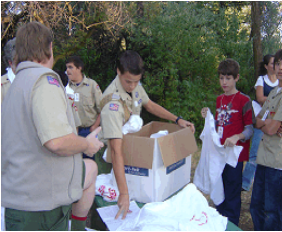
Passing out the shirts to the Candidates

and all of the trimmings. At this ordeal the candidates were presented with a Lodge Service shirt so that they would be recognized in the crowd attending the farm