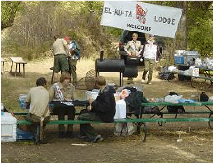
A little preparation and planning

It worked really well and there were many questions about the OA and the Scouts from the public who were in attendance. Might be something for us to consider in the future.