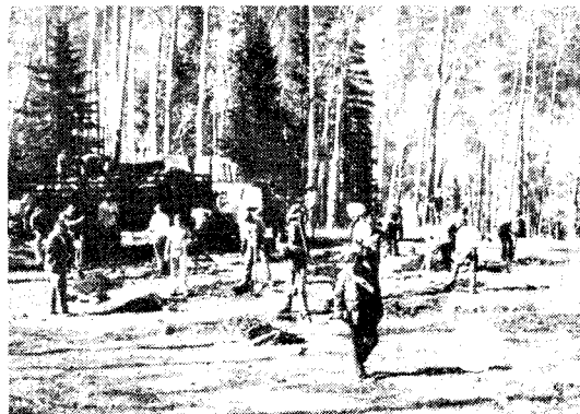
Candidates working on the new warehouse at East Fork of the Bear.