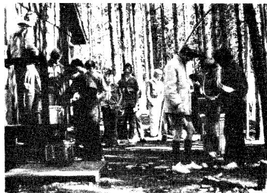
Feeding candidates during Ordeal at East Fork. It was cool and brisk.