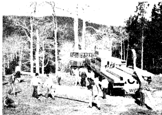
There were 350 people at the ordeal. 250 new Arrowmen joined our ranks.